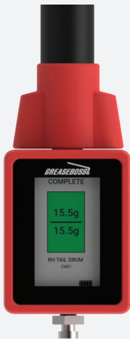
GreaseBoss Manual Head Unit

GreaseBoss ensures greasing is completed to the OEM spec, protecting your interests on warranty claims